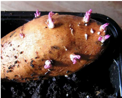
Picture of sweetpotato nodes